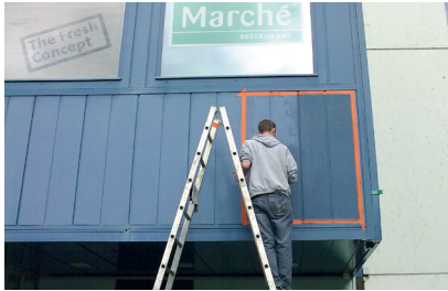
September 2010 Test area on the chalked façade

Proven under the most extreme conditions