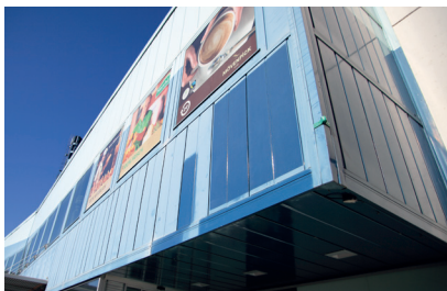
September 2013 After three years no change in color and no loss of shine