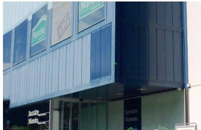
September 2010 Definite difference before and after