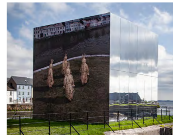
Mirror Pavilion, Galway (Ireland)