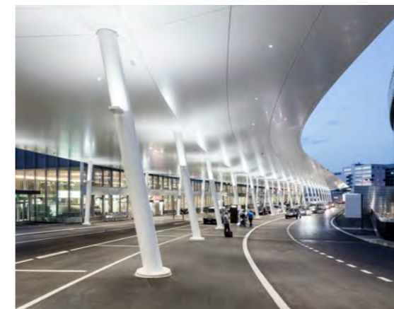
Driveway Airport Kloten, Zurich (Switzerland)