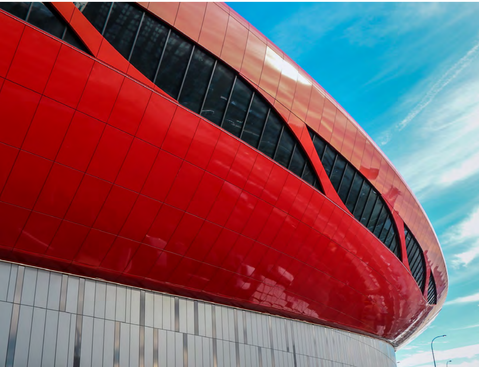
Terminal E, Boston Logan Airport (USA)

ICM, HDPE and SMP are competitive and PFAS-free alternatives to fluorocarbons. They are less durable but very economical and also allow all possible colors and effects to be achieved.