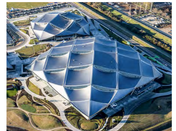
Google Bay View Campus (USA)