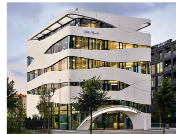
Otto Bock Science Center, Berlin (Germany)