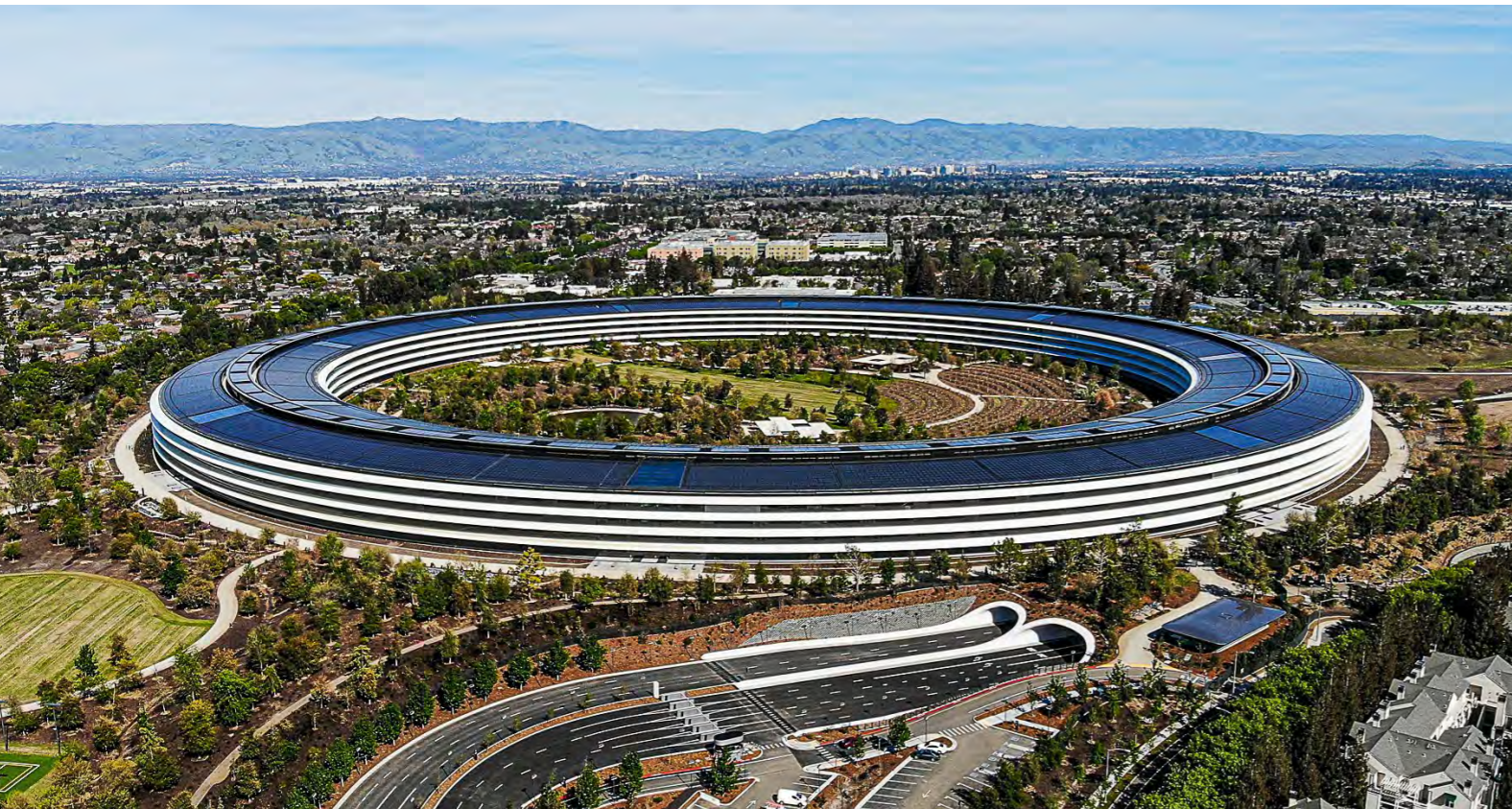
Apple Park (Apple Campus 2), Cupertino (USA)

Our solutions meet these challenges, offering enduring options for projects of any size. We provide sampling services for substrate compatibility and aesthetic harmony, along with color design services for perfect matches. Additionally, we offer tools for on-site repair, maintenance, and cleaning, ensuring ease and effectiveness. These comprehensive services ensure visually striking, durable, versatile, and maintainable architectural projects, securing their value for the future.