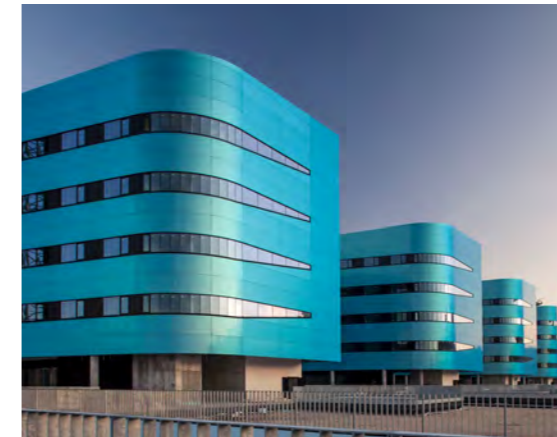
Álvaro Cunqueiro Hospital, Vigo (Spain)