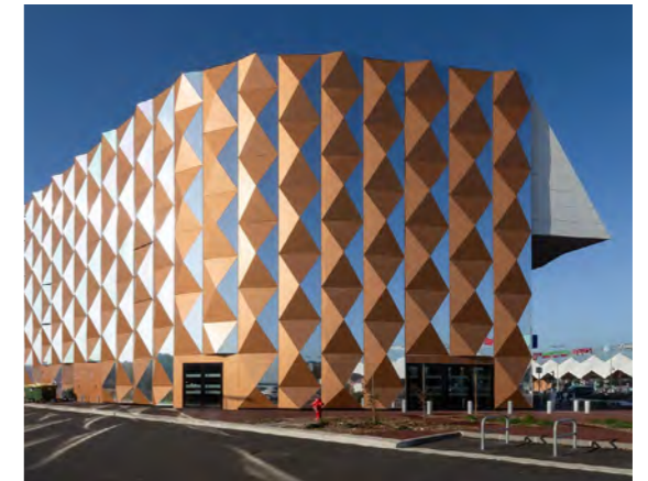
Lumix Brétigny-sur Orge (France)